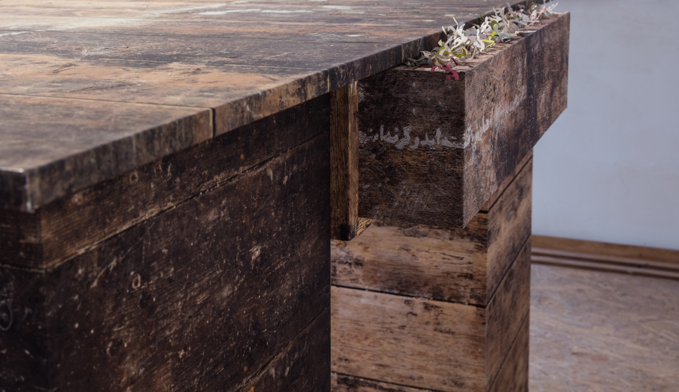
Installation view| Amanatdari platform| Iran| Rasht|2024