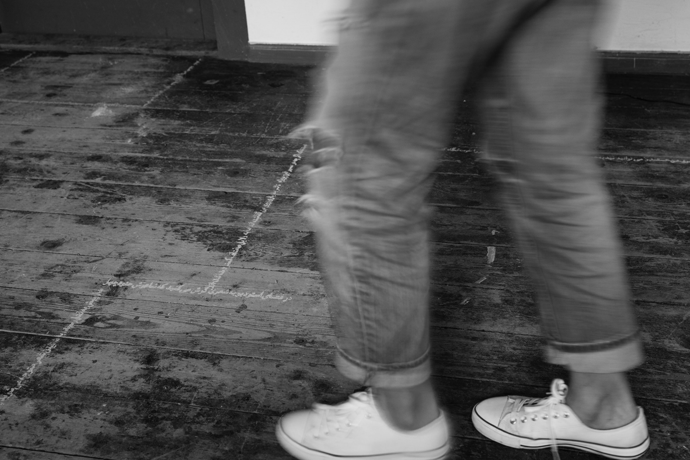
Installation View | Open Studio day ( people are walking on the words which are written on the floor) | Germany | 2023