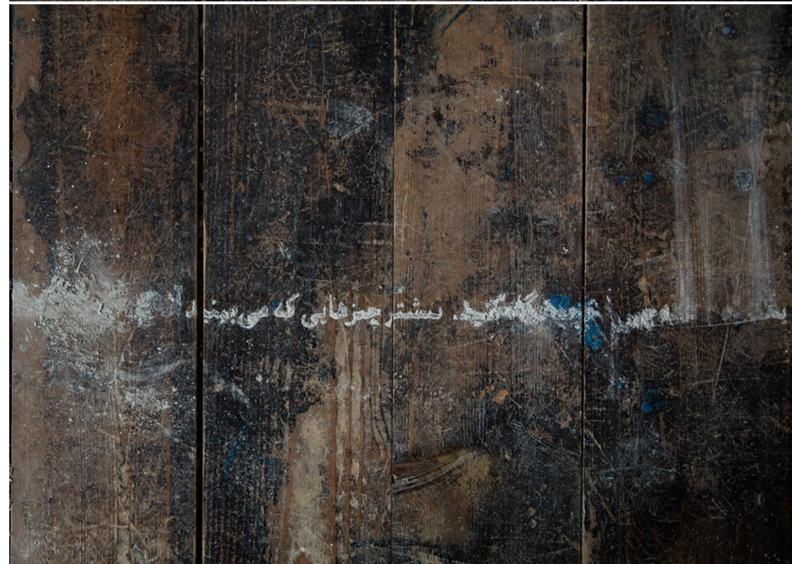
The text was stenciled on the ground with chalk powder