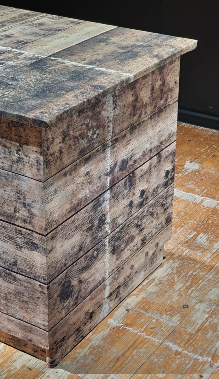
Installation view| ACC Gallery|Germany| Weimar| 2024